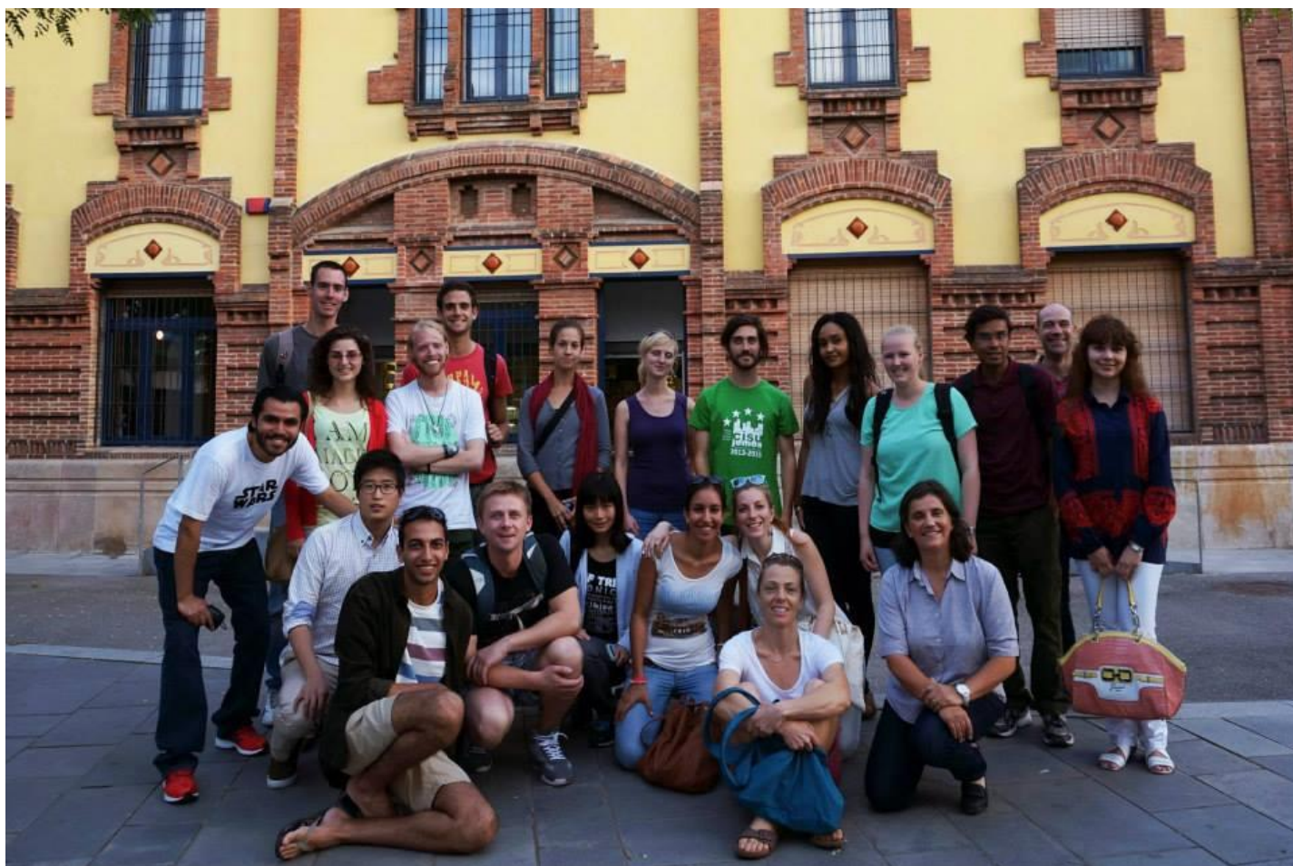
Fall meeting 2013 in Barcelona with first year JEMES CiSu students and coordinators

University of New South Wales, Beijing Normal University and Columbia University in the city of New York. JEMES CiSu students have the opportunity to go for a 3-month period to one of these partner universities to work on a research project. Like the old JEMES programme, the new programme is divided in two sub-themes: Sustainability Management & Planning (with AAU, and UAB) and Sustainable Technologies & Processes (with TUHH, and UA) but now has one overarching theme: Cities & Sustainability . The JEMES Alumni Association will connect both JEMES and JEMES CiSu students.