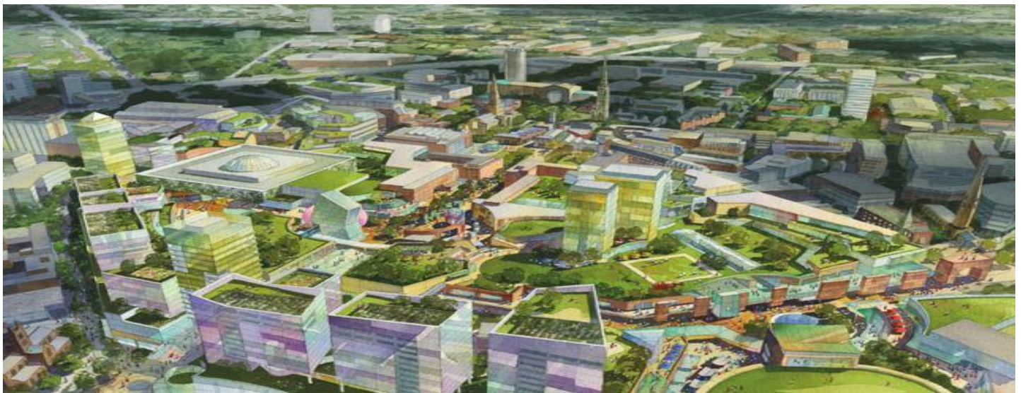
Coventry City Council watercolour