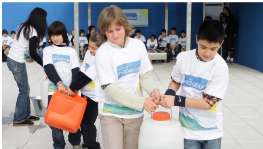
Ondablue workshop in local schools in Barcelona and Madrid