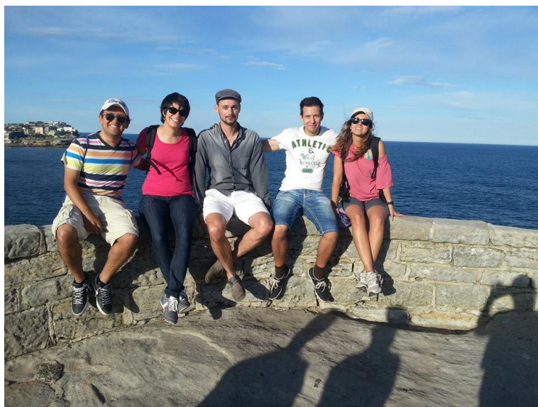
Group of JEMES CiSu students in Sydney